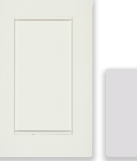
MDF CABINET PAINTED CHANTILLY LACE