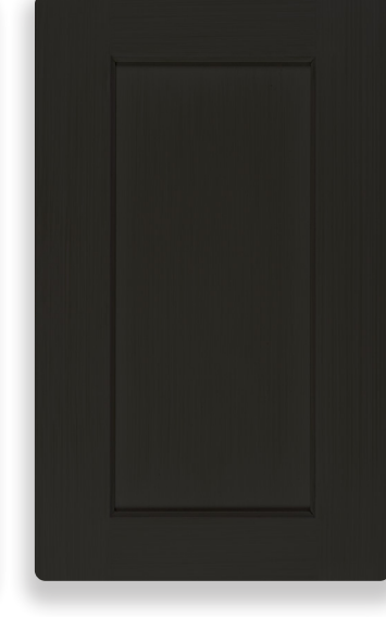
MAPLE CABINET BLACK STAIN