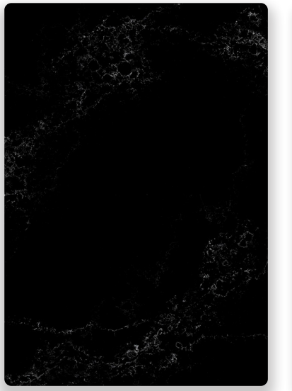
CAESARSTONE EMPRIA BLACK